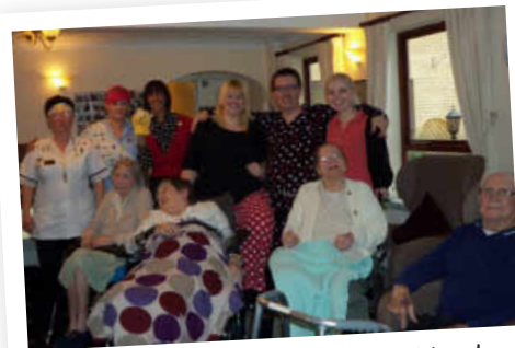
Fundraisers for Children in Need

A month later, staff dressed up, paying £1 for the