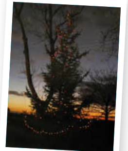
O Christmas Tree! O Christmas Tree! Thy candles shine so brightly!