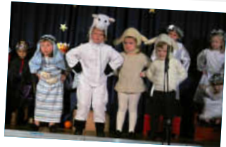
The Grumpy Sheep