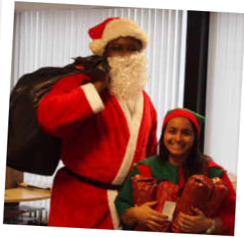
Santa and the Elf