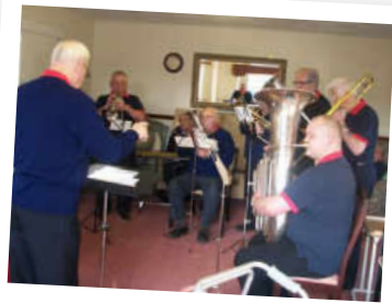
Salvation Army band

the launch of Tallington Tributes, a quarterly newsletter for all involved at the home and beyond, in response to Voices, because so much goes on at Tallington, there isn't enough room for