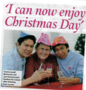
A clip from 'Yours' magazine