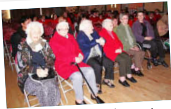
Enthralled residents at Ayscoughfee Hall School

followed by mince pies and cups of tea afterwards. The next week some residents were taken to Ayscoughfee Hall School, by special invitation, to watch its Christmas productions, an immensely enjoyable time