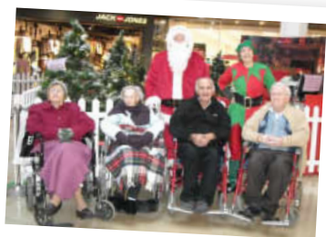
Santa in Queensgate!