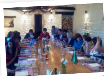
A good time being had by all!

The directors indulged managers and Head Office staff with a thoroughly enjoyable, delicious Christmas lunch at The Olive Branch, near Stretton. Staff agreed they would be prepared to make do with a repeat